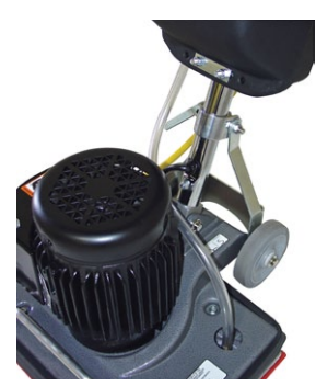
Solution is applied to the pad when released by a manual trigger on the 4 gallon solution tank. (high speed model)